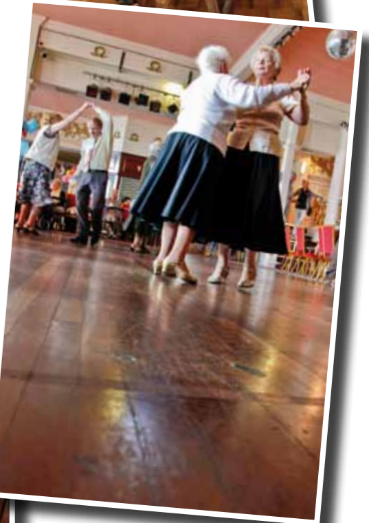
Action from the Tea Dances at Llandudno and Towyn.